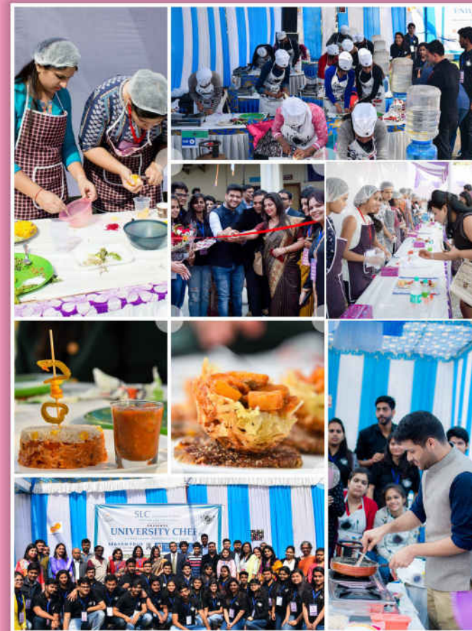
Glimpses of Edition One and Two